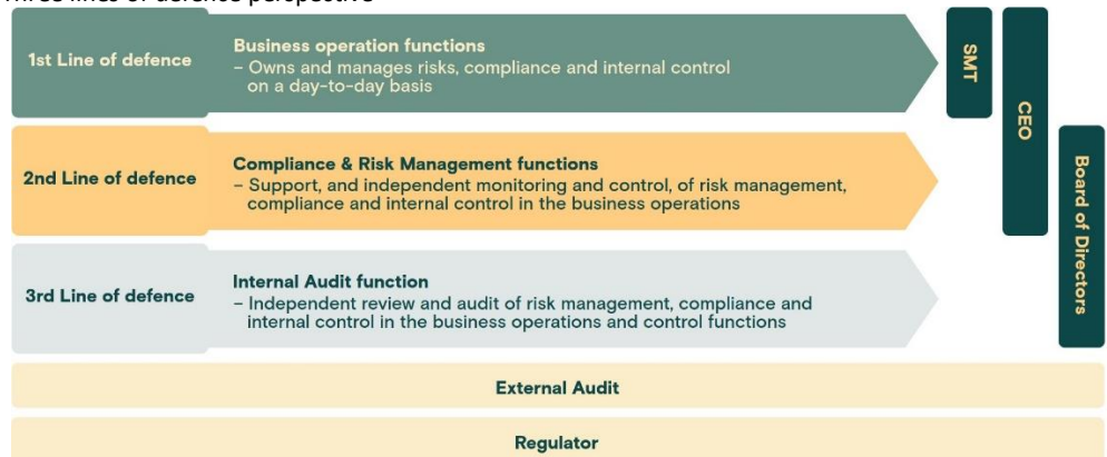
Figure 3.2 Three lines of defence perspective